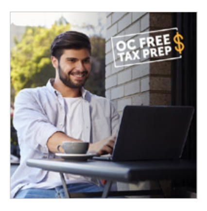
File your taxes for free without leaving your home with MyFreeTaxes.com