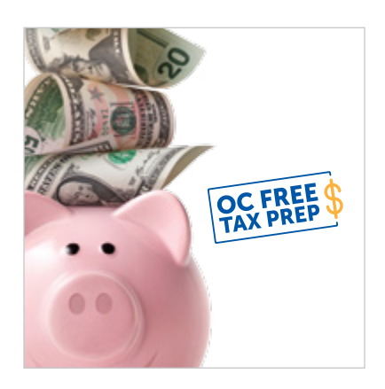
Filing your tax return is the only way to claim tax credits owed to you. Learn ocfreetaxprep.com