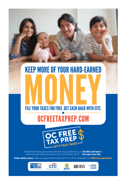
11"W X 17"H