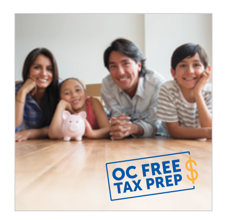
KEEP MORE OF YOUR HARD-EARNED MONEY Families count on OC Free Tax Prep to ensure they receive the cash-back tax credits they've earned. ocfreetaxprep.com