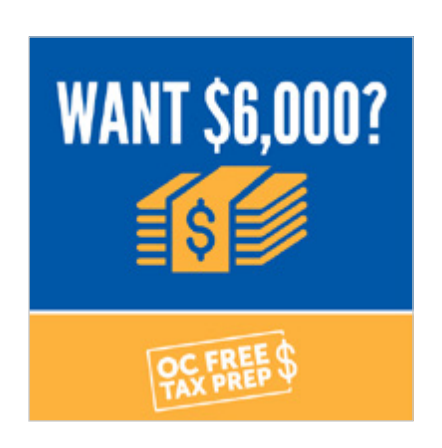
What would you do with an extra $6,000? Find out if you qualify for California and federal EITC. ocfreetaxprep.com