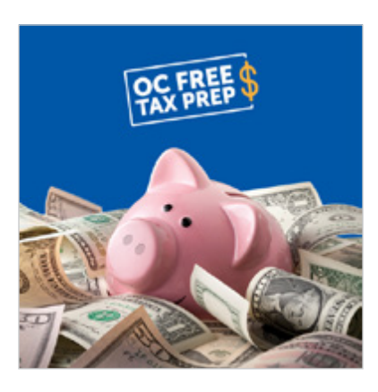
The CalEITC tax credit can add dollars to your refund! ocfreetaxprep.com