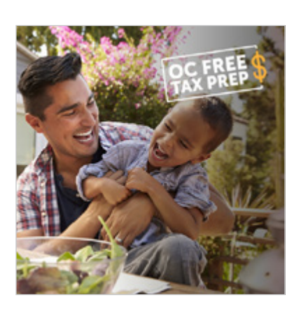
Tax prep that's FREE, EASY & SAFE. File your taxes for FREE online at MyFreeTaxes.com